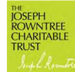
Joseph Rowntree Charitable Trust