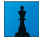
LA FINANCIERE DE L'ECHIQUIER